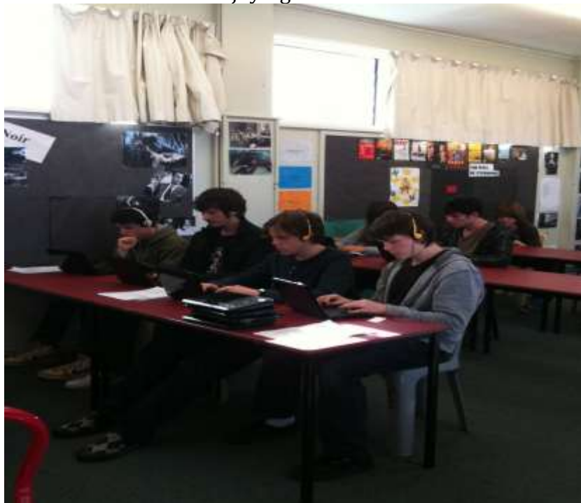
Students Enjoying Netbook Use

Interested in finding out more about PAG? Our final "meeting" of the year is Thurs 8 December, 7.30pm at MALT (442 Richmond Rd – corner of Hakanoa St). Feel free to come along!